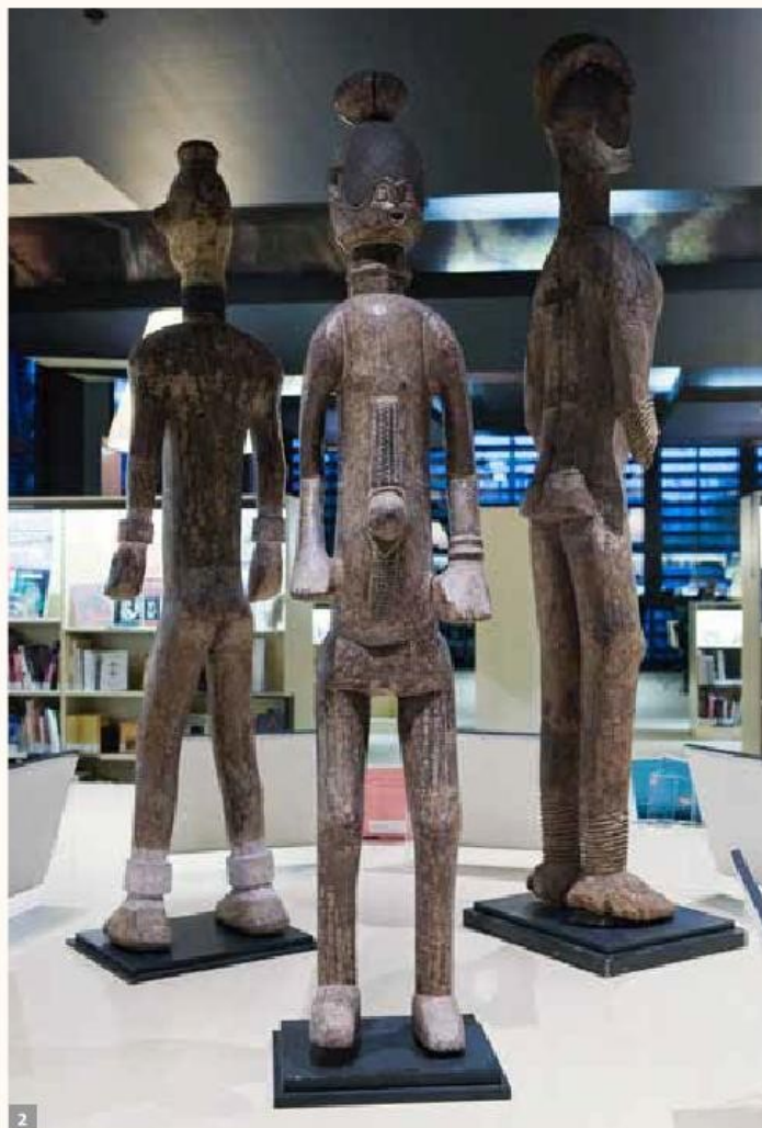
2 Photo d'un groupe de statue Ibo, salon de lecture Jacques Kerchache Musée du quai Branly, Paris