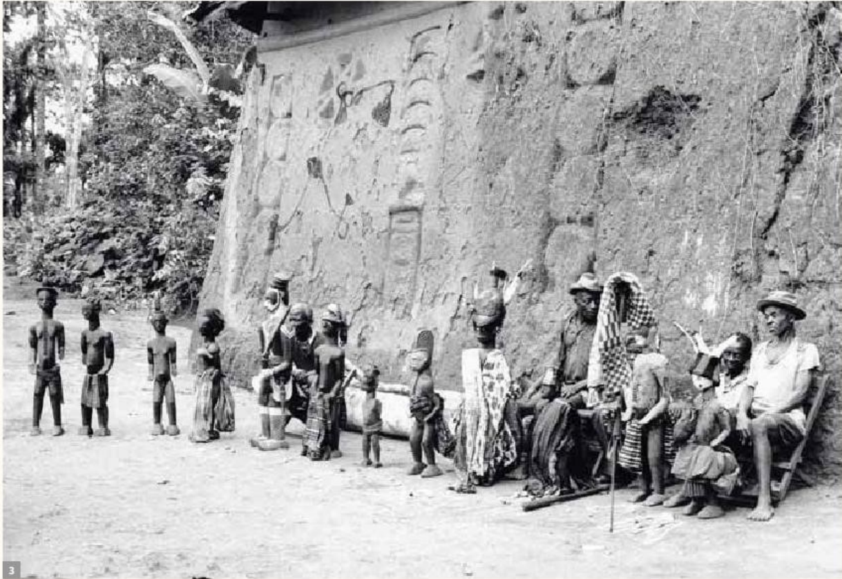
3 Festival of images of the annual outing of tutelary deities in Oreri, outside of tall wall surrounding the compound of the major god Eke , Village of Oreri. Photo : Herbert Cole, 1966