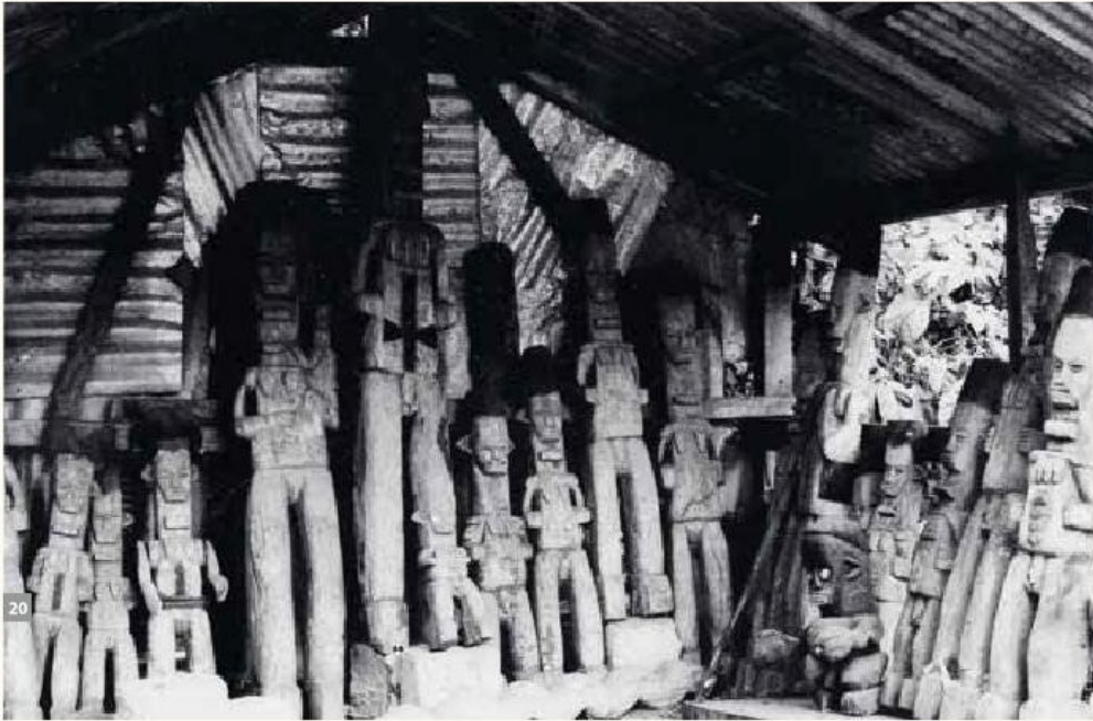
Family, genre figures and animals in Iyiafo shrine in Mbieri.

Collection privée, Angleterre, avant 1969