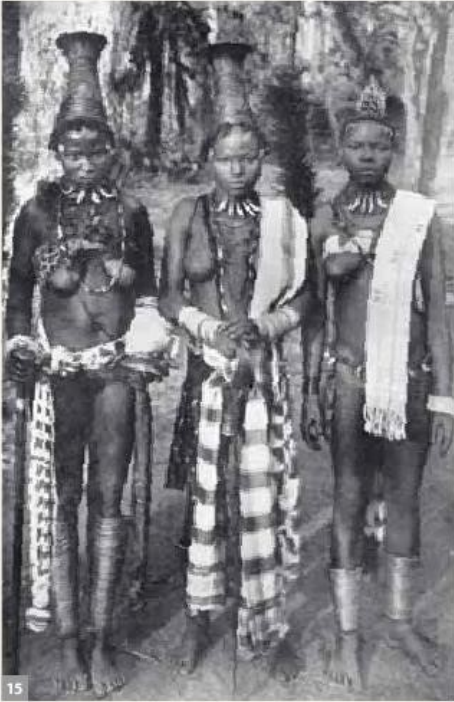
Prospective brides of chiefs. The staves and ivory bracelets are loans from their future husbands.