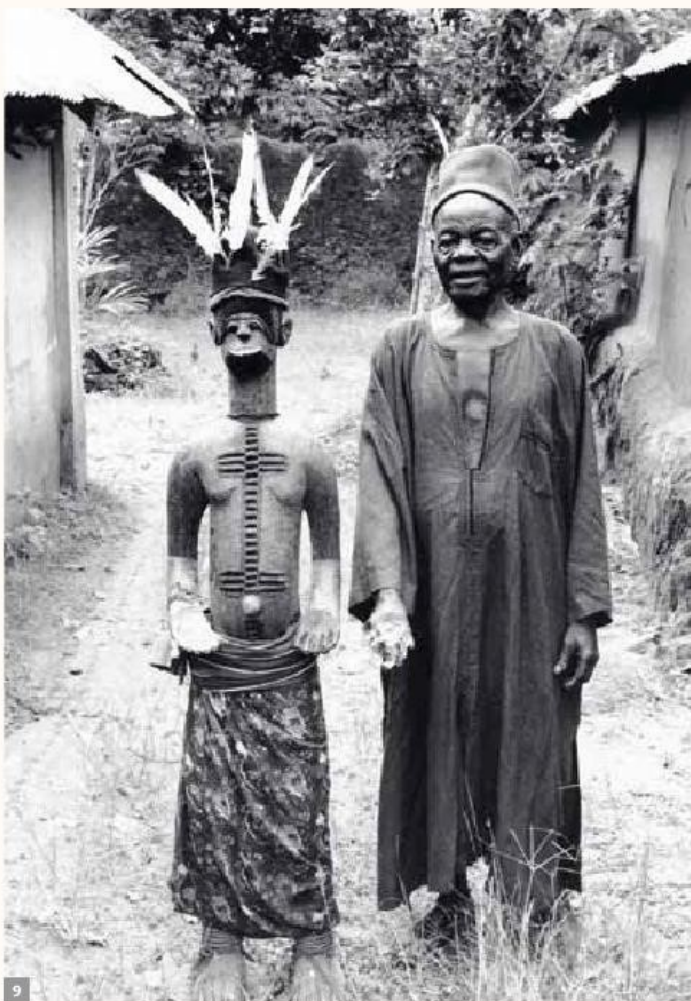
Deity ( Eke) and priest at Adazi-Ani. Priest holds ofo (an ancestral bundle with blood and feathers). Both wear title ( ozu) hats with eagle feathers. Both have ichi scarifications.

Milano, Studio Carlo Grossetti, Scultura monumentale della Nigeria, Le Figure degli Ibo , November 1985 – February 1986