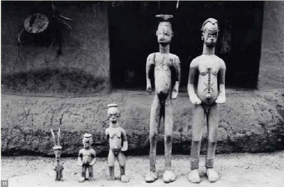
Ezeiyi (tutelary god) and family. Far right carved circa 1910, a replacement for second from right perhaps mid 19 th century, kept for the village of Umumri Neni by the Umuo Kaezeduku family. Smaller figures are Ezeiyi's son (smaller) and daughter, and of course ikenga . Photo : Herbert Cole, 1966