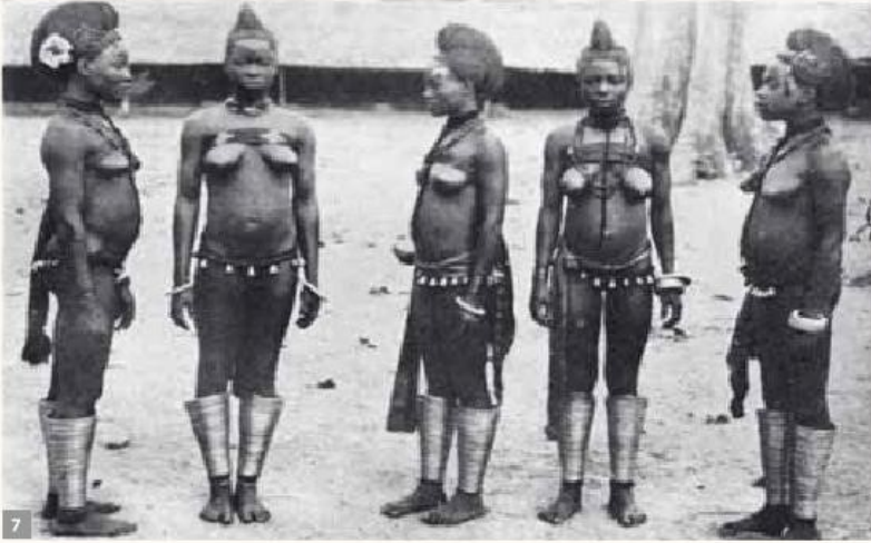
Girls from the Eastern interior district preparing for marriage in gala dress.