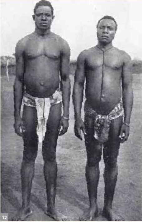
12 Young Igbo men.