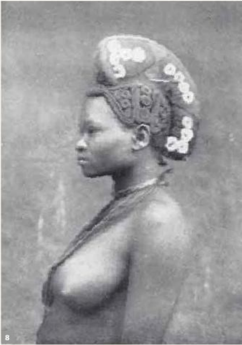
A young lady from Awka