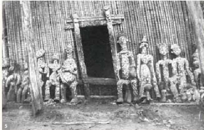
5 Commemorative Royal Ancestral Figures of the kings and queens of the Batoufan kingdom. Photo : Father F. Christol, 1925