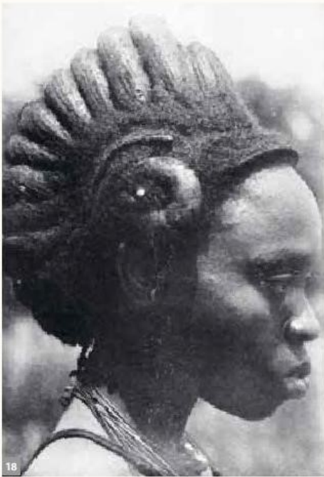
18 Hairdressing as a work of art.

Milano, Studio Carlo Grossetti, Scultura monumentale della Nigeria, Le Figure degli Ibo , November 1985 – February 1986