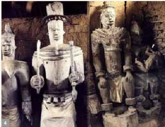
4 Urhobo, Nigeria. Shrine of Owedjebor, founder of the town of Ogherhe and various family members.