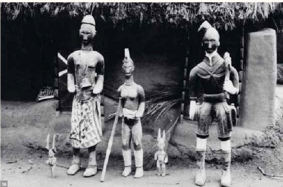
Five shrine figures including the "chief" (left), a deity named Eze Imeke of Umudioka Neni, called "founder" of Umudioka village but a general tutelary spirit. Figures are members of his family - his wife and "police" son. Both males have ikenga.